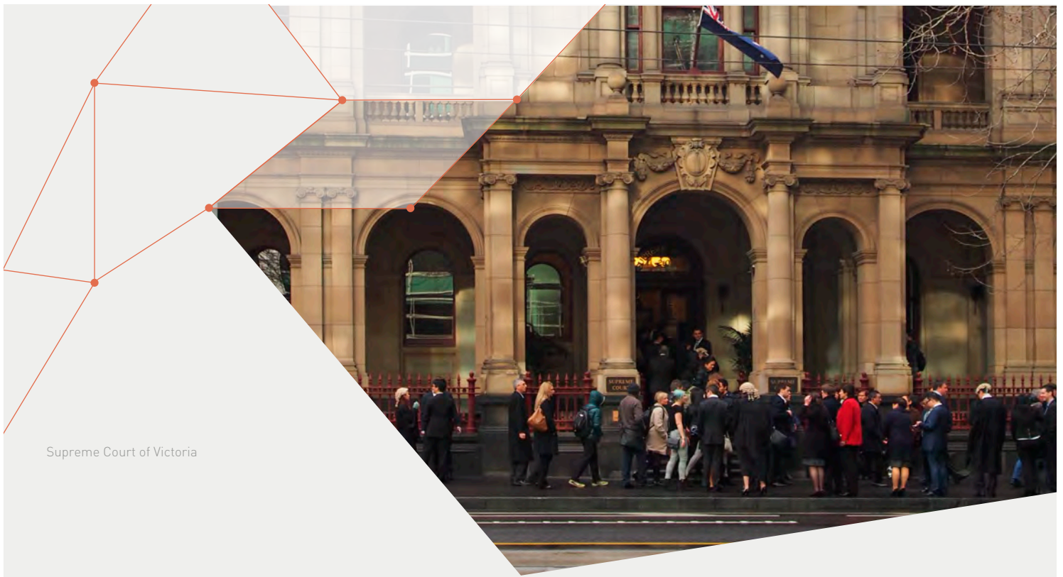
Supreme Court of Victoria