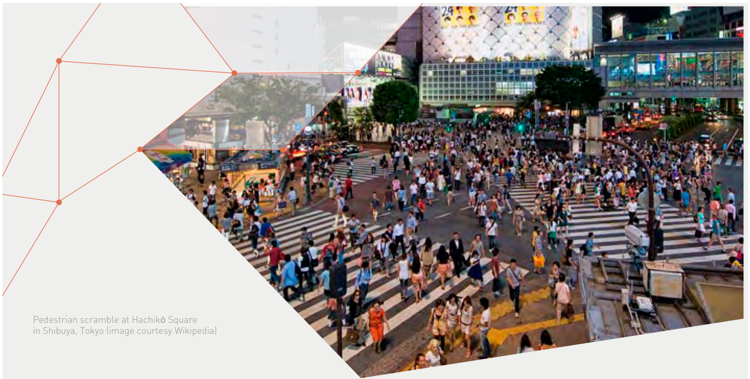
Pedestrian scramble at Hachikō Square in Shibuya, Tokyo